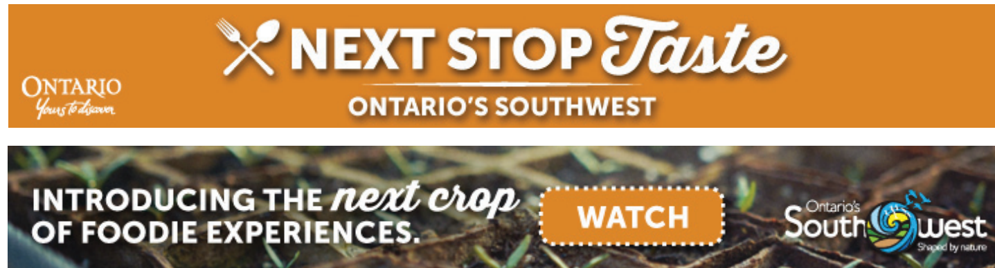
Leaderboard 728x90 - ANIMATED GIF (Slide1, Slide 2)