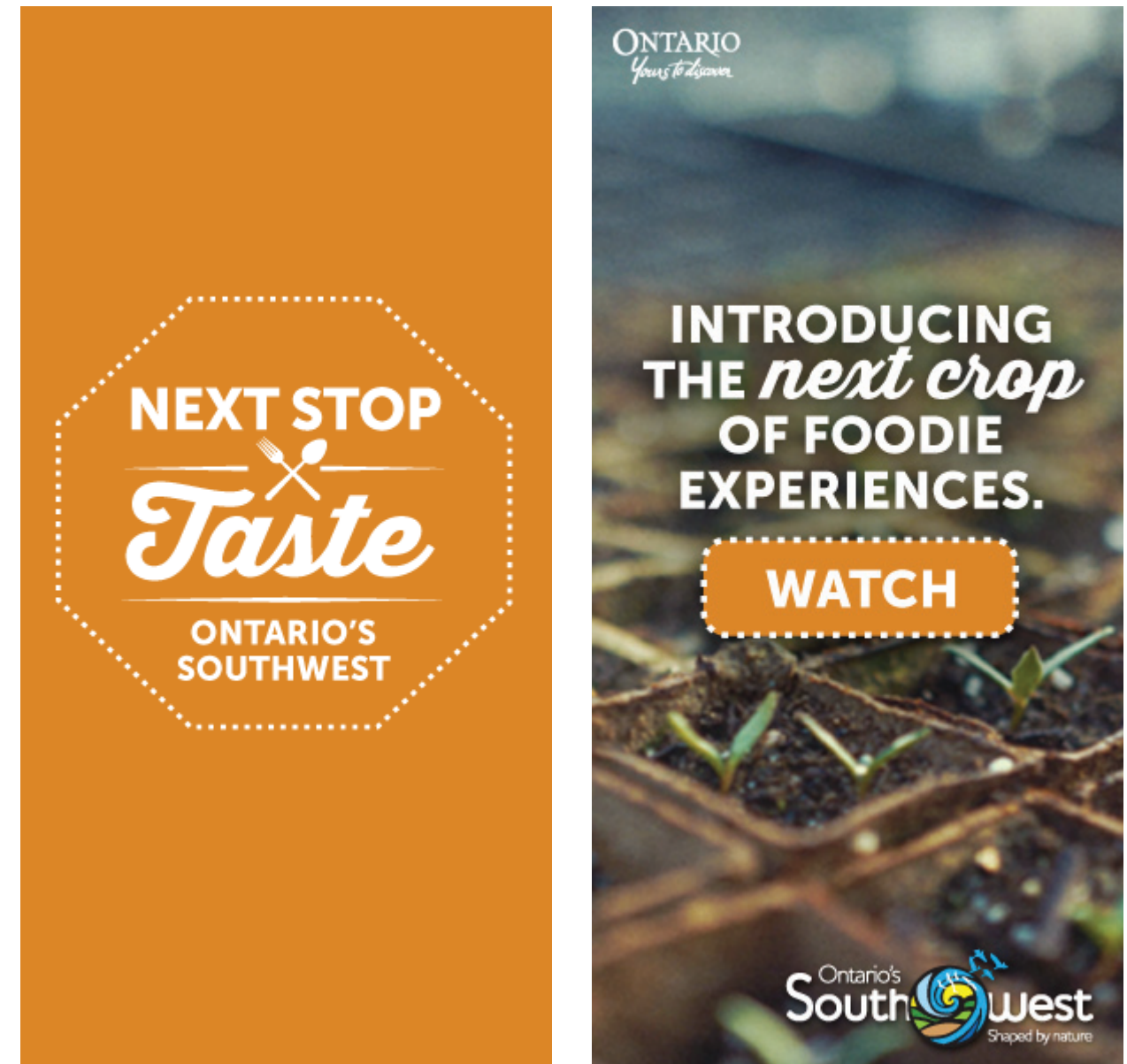
Half Page Skyscraper 300x600 - ANIMATED GIF (Slide1, Slide 2)